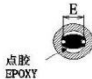
底视图 BOTTOM VIEW