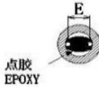
底视图 BOTTOM VIEW