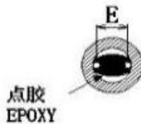
底视图 BOTTOM VIEW